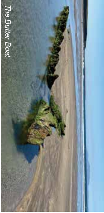
The Butter Boat

Streedagh is the only beach where three Spanish Armada ships were wrecked in the one place. Usually covered in sand in shallow waters offshore, the wrecks of La Lavia , Santa Maria de Visón and La Juliana become visible in 1985 and again in 2015, when several cannon were recovered and brought ashore. These artefacts are now under conservation by the National Museum of Ireland. Each September Remembering the Armada, a commemorative festival, takes place at Streedagh to mark these tragic events.